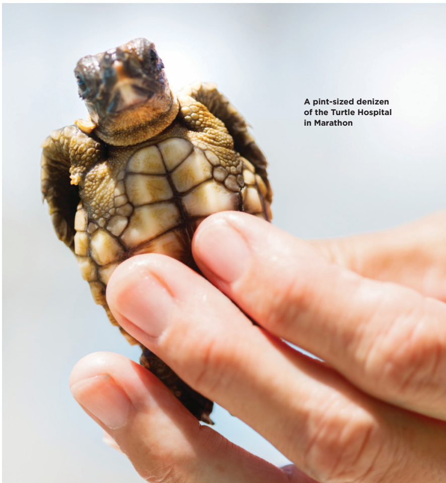
A pint-sized denizen of the Turtle Hospital in Marathon