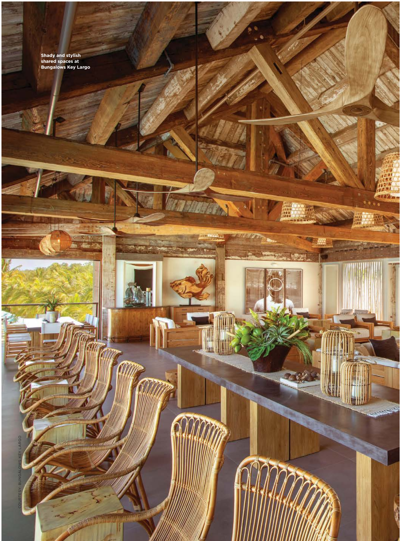
Shady and stylish shared spaces at Bungalows Key Largo