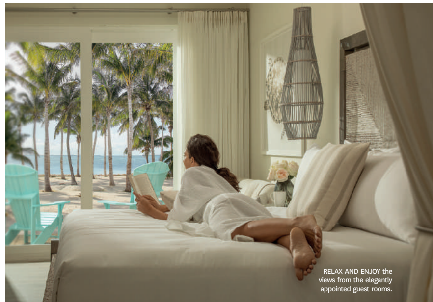
RELAX AND ENJOY the views from the elegantly appointed guest rooms.

Picture: 135 individual bungalows surrounded by the tranquil beauty of the Gulf of Mexico. No kids allowed. Instead, guests 21 and older take advantage of each bungalow's private veranda outfitted with outside rain showers and soaking tubs, a spa bathroom with rainfall shower, a 60-inch Beyond TV, daily housekeeping and turndown service. Each bungalow is outfitted with two cruiser bikes for getting around the resort.