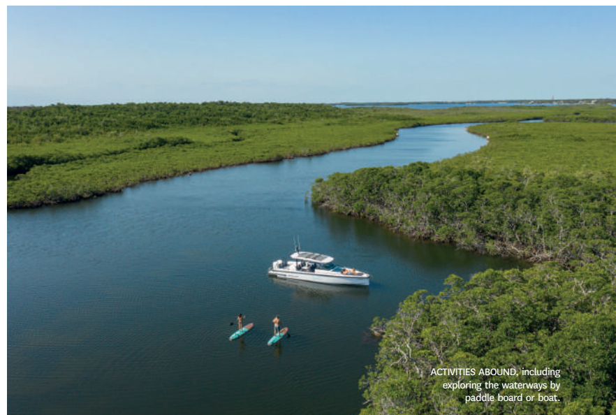
ACTIVITIES ABOUND, including exploring the waterways by paddle board or boat.