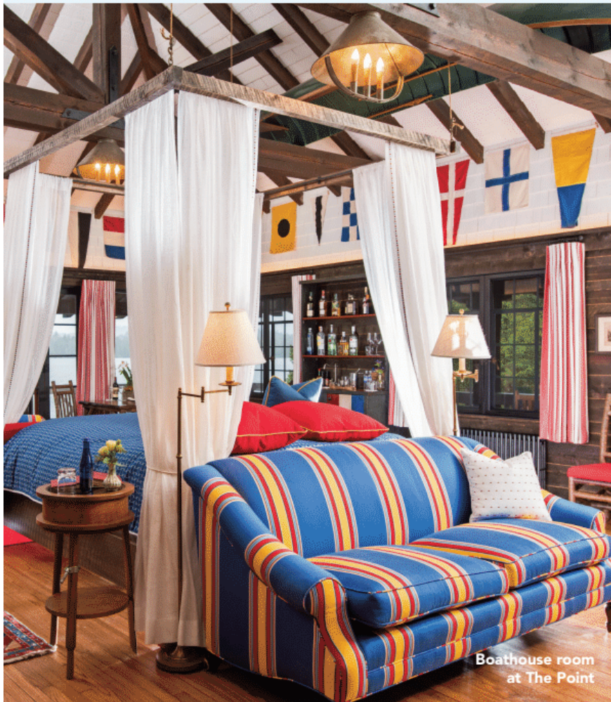
Boathouse room at The Point

► How is gratuity handled? Some properties, such as The Green O, have a no-tipping policy ("all staff members are well-compensated and highly valued by the management and owners," a pre-arrival note states). Others, such as Bungalows Key Largo, provide a gratuity check to sign after every service, meal or drink.