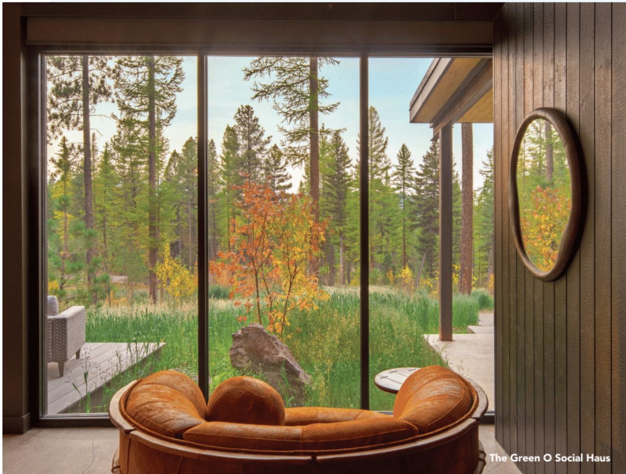
The Green O Social Haus