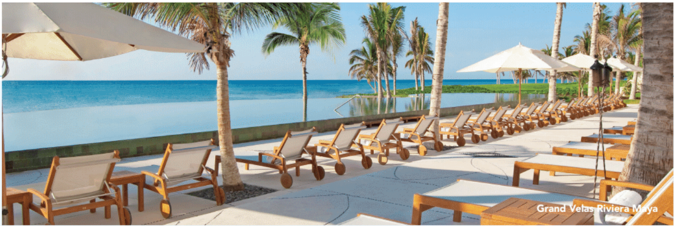
Grand Velas Riviera Maya