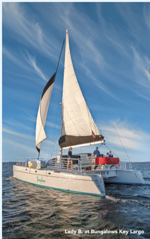
Lady B. at Bungalows Key Largo

Make advance reservations at Bogie and Bacall's (the name inspired by the stars of the 1948 film Key Largo ), the resort's undisputed favorite restaurant. Start with craft cocktails at the Hemingway Bar before a multicourse fine dining affair that evokes visions of old Hollywood.